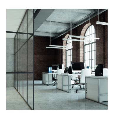
VANEAU BUREAUX & COMMERCES +10 000 offres disponibles

VANEAU VIAGER 30 ans d'expérience en vente viagère