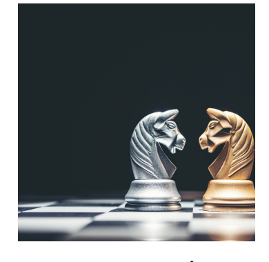
COURTAGE CRÉDITS Exell Crédit immobiliers Assurances emprunteurs