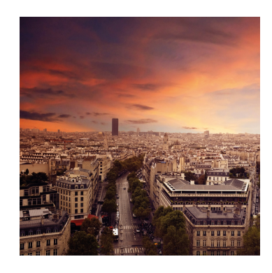
VANEAU Immobilier de prestige depuis 1972