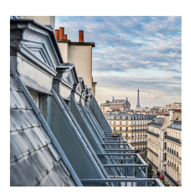
GESTION LOCATIVE GTF, plus de 7 000 lots gérés à Paris