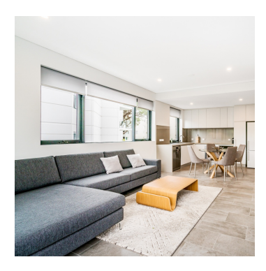
VANEAU LOCATION Une équipe dédiée à Paris, Neuilly et Boulogne