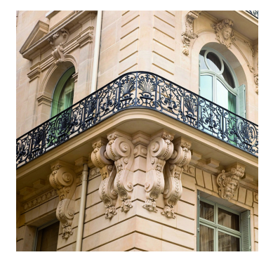
VANEAU PATRIMOINE Dispositifs de défiscalisation, SCPI, Assurances Vie